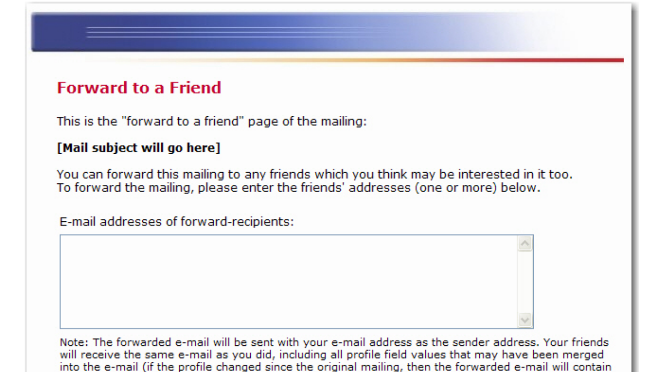
Figure 6: Customizing the Forward-to-a-Friend Page

The default Forward-to-a-Friend page is completely customizable, just like the other Subscriber Interface pages.