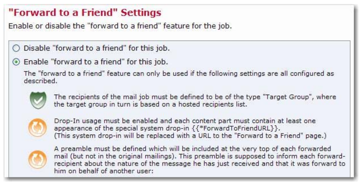
Figure 2: The "Forward to a Friend" Settings Screen

After enabling this feature, you will need to make sure that the conditions described on the screen are correctly met and the settings are configured accordingly. If a condition is not met, then the Orange Circle icon appears next to it. When a condition is met, then the Green Shield with a Checkmark icon appears next to it.